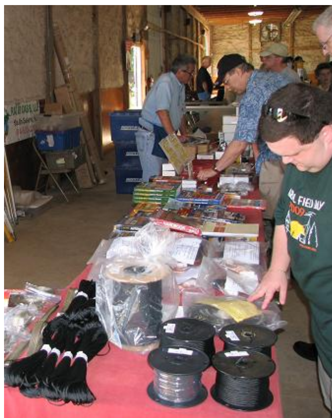
Some prospective buyers sifting through the goodies for sale by Radio Oasis at the MARC Hamfest.

* $900.00 Rental fee waived for Kimberton Fire Co. Fair Grounds since MARC assisted with the Kimberton Fair.