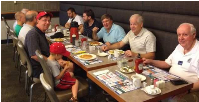
Breakfast Meeting for July 14, 2012

My thanks to all members who give generously of their time and energy to help make our club the success that it is.