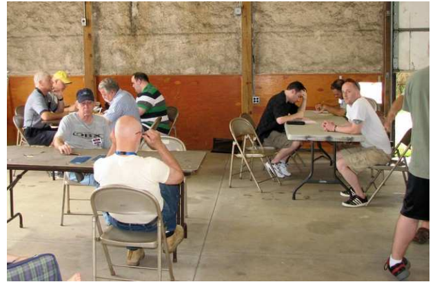
VE Test Session

For the second year in a row we held a very successful VE Test session at the hamfest. A total of twelve candidates took tests and many licenses and upgrades were earned. Congratulations to those who upgraded or earned new licenses.