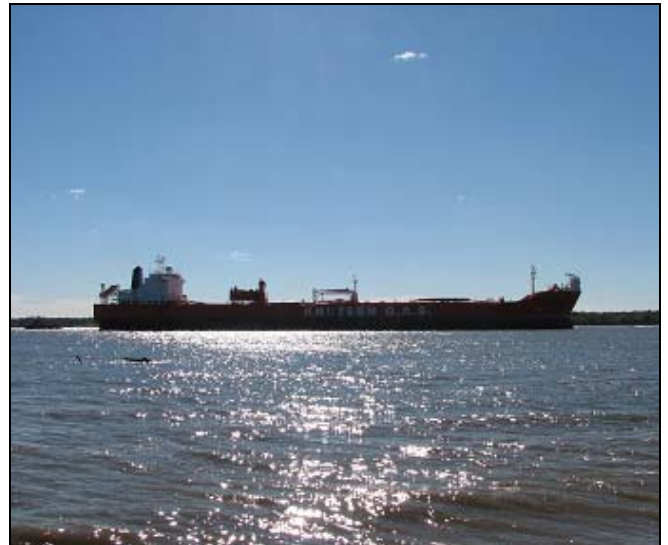
View of a HUGE Cargo Ship only 400 Feet Away From Our Temporary Station – The Delaware River Is Busy

PA is the state where the island is located, 045 is a unique number assigned for the island and R designates that this island is located on a river. See www.usislands.org