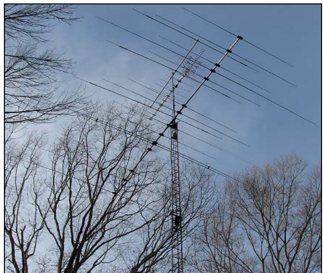
A Multi-Band HF Antenna Array at 70+ Feet