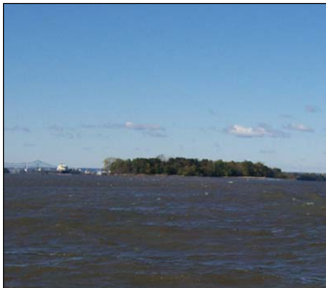
PA045R - Little Tinicum Island on the Delaware River, Commodore Barry Bridge on left – photo by KF3CD

The U.S. Islands Awards Program is separate from the IOTA program, and, it was started to activate islands in the US and generate further interest in working those US islands. USI is open to hams and SWLs. The basic rules stipulate that: an island must be within the 50 states or territories of the US, must be at least 100 feet long in any direction and, located at least 50 feet from the main shoreline when operated from. At least 25 QSOs must be made (including 2 different DXCC entities) in order to activate a new US Island.