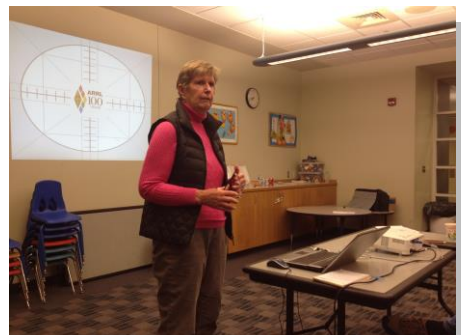
February Club Meeting