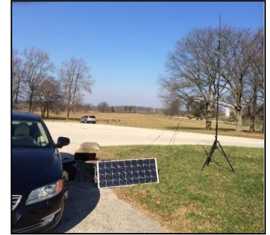
At Valley Forge National Park 1/2/16