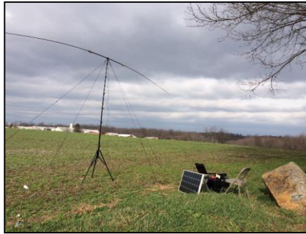
“From The First state on the first day!” at First State National Historical Park on 1/1/16