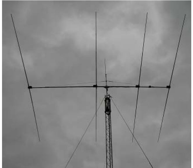
K3SUE's SteppIR 4 element, HF/VHF yagi antenna