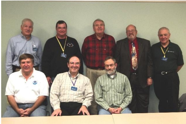
MARC Board of Directors 2010-2011

The annual election of officers and standing committee chairs was held at the MARC General Membership Meeting on Tuesday, September 21, 2010. Refer to the sidebar on page 3 for full names, titles and contact information.