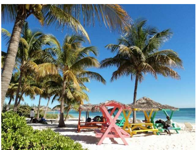
Taino Beach Resort

This trip was only four days long; same as back in 2012. The weather was cool for the Bahamas with high temperatures in the upper 60s. The Islands of the Bahamas are gorgeous and the people are very friendly. I highly recommend going there whether for hamming or not. Our home was within a few minutes' walk from Taino Beach.