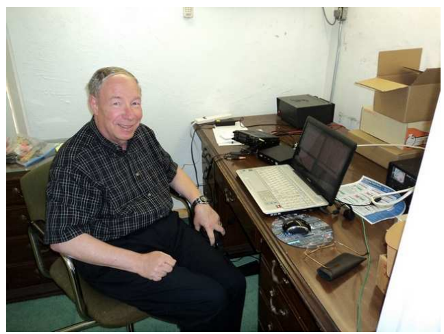
AI N3EA operating as C6AEA from the Bahamas

This trip was only four days long; same as back in 2012. The weather was cool for the Bahamas with high temperatures in the upper 60s. The Islands of the Bahamas are gorgeous and the people are very friendly. I highly recommend going there whether for hamming or not. Our home was within a few minutes' walk from Taino Beach.