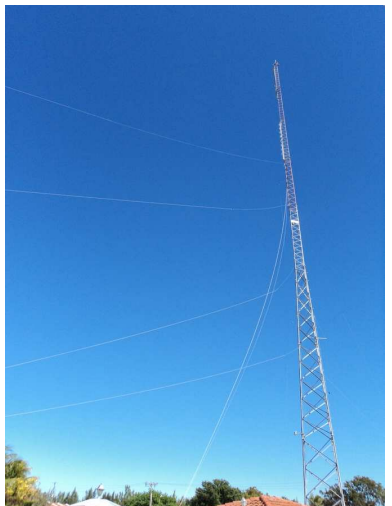
Antennas strung from unused 160-foot commercial tower

80 feet, the 20m antenna at 70 feet and the 10m antenna at 60 feet. The saltwater nearby also helps a lot.