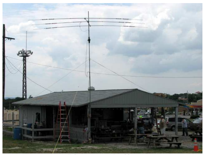
Tribander and Pavilion

The food situation was a bit different from previous years in that we had some chips and pretzels on hand and went out and got some hoagies from Turkey Hill and a few pizzas from a decent pizza place right across the street from the firehouse. Bob Palin N3JIZ and Dieter K3DK brought 3 large coolers so there was plenty of ice cold drinks and cold water. Since there wasn't such a BIG focus on food/eating, it was less of a distraction and more people were digging in and operating.