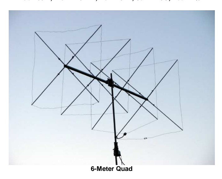
We once again had a G5RV up about 40-45 ft, a tribander for 20, 15 and 10 meters and a quad for 6-meter active. Our QSO scores were significantly higher than in 2009.