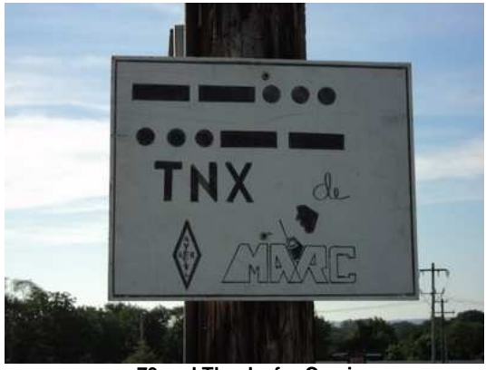
73 and Thanks for Coming