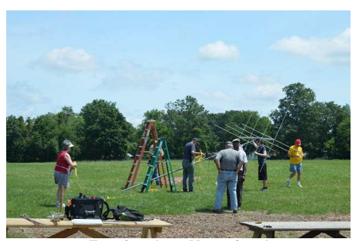
Erecting the 6-Meter Quad

later found out that the rotator didn't work. Of course we managed Ok with the traditional "armstrong" method of antenna rotation.