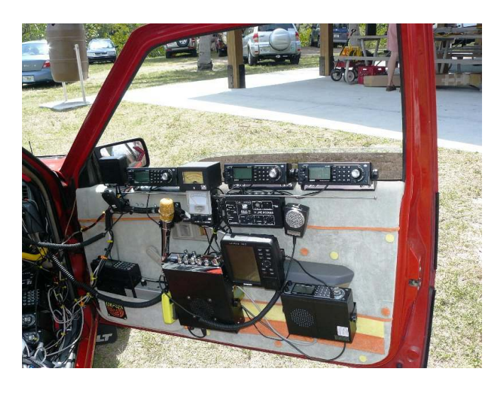
Inside passenger side door

More pictures can be found at: http://www.jtrg.org/Photoalbum/Members/AF4KK/AF4KK-Project%20Car/index.html.