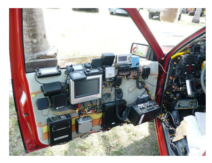
Inside driver's side door