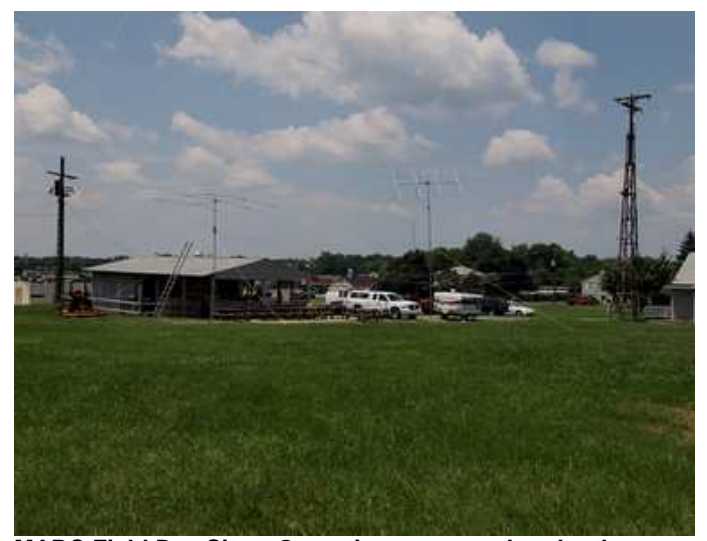
MARC Field Day Site – Operations occurred under the pavilion roof. 3 element HF yagi on center-left and 6 meter quad on center-right.

The new site was about 250 feet higher in altitude when compared to the old one and that not only translated into a better position for propagating radio signals, but also provided a nice cool breeze that was pleasant for all and negated the use of any fans that were brought on site. We also had the fortune of being able to operate from a pavilion with a large, open area and picnic tables. Consequently, we didn't have to pitch tents or assemble the awning as required in years past.