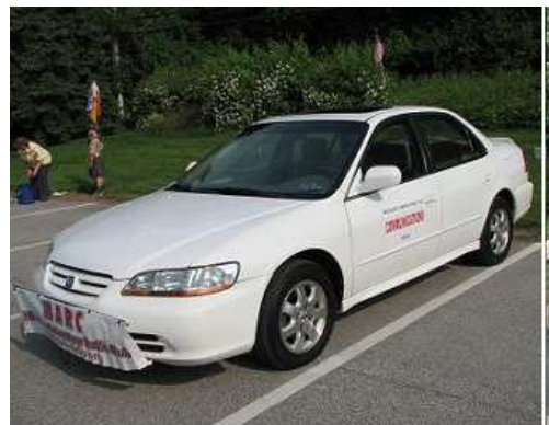
The Memorial Day MARC Float

Below are a few of the Memorial Day parade entries... Maybe we can talk Floyd KA3OXA into entering his shiny SUV in next year's parade as the MARC float!