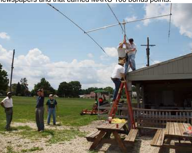
Mounting the HF Yagi was a team effort, and the results were worth it.

surrounding area. We refueled the generator once during Field Day operations and restarting the generator was uneventful. Owen Pearl scored 20 bonus points as a youth operator. Jim W3DCL submitted a notice to local newspapers and that earned MARC 100 bonus points.