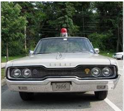
All original – 1966 Dodge Polara Police Cruiser with 383 Big Block