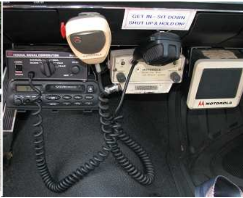
Any self-respecting ham MUST Take a picture of the Motorola Motrac'