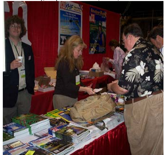
Shoppers at Dayton 2008 Flea Market