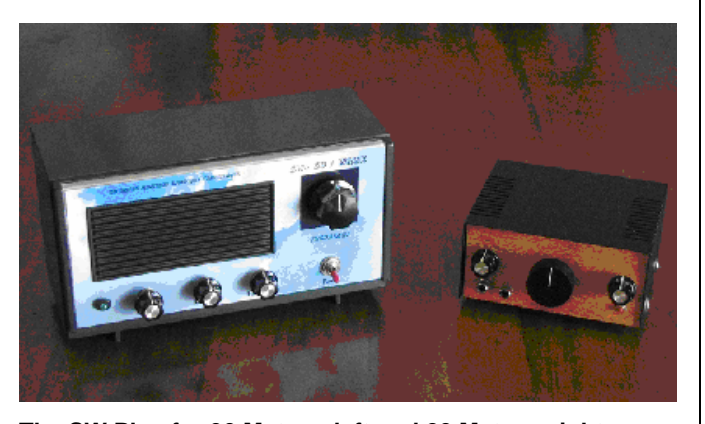
The SW Plus for 30 Meters, left and 20 Meters, right