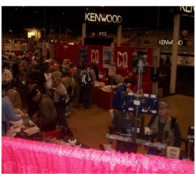
Main Vendor Display Floor at Dayton Hamvention

Precisely on time, the Hara Arena main doors flew open, and a mass of hams of all ages, sexes and sizes rushed in. The arena is quite sprawling, with vendors and other amateur-radio concerns occupying just about every open floor space, as well as corridors and other public areas. It must be seen to be believed – hams for as far as the eyes could see! The floor was a collage of sight and sound, with HF radios, antennas, power supplies, salespeople, etc. from vendors such as Kenwood, Yaesu, and ICOM all competing for our attention. Their exhibitions were impressive, as was the amount of freebies (caps, buttons, totes) they distributed. I certainly collected as many as I could! Specifically, it was great to add another Yaesu cap to my collection.