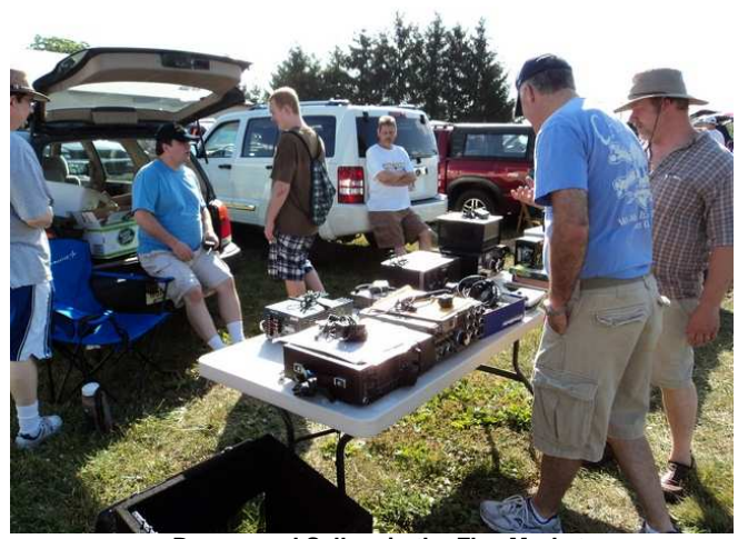
Buyers and Sellers in the Flea Market