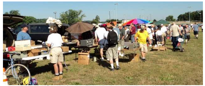
Great Crowd in the Flea Market on a Beautiful Day

The date for the 2012 MARC Hamfest and Computer Fair will be Sunday, July 8, 2012.